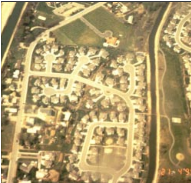
Figure 2: Many Western Developments Create Needless Impervious Cover

Some stormwater practices developed in humid watersheds are simply not applicable to arid watersheds, and most others require major modifications to be effective (Table 4). Even in semi-arid watersheds, design criteria for most stormwater practices need to be revised to meet performance and maintenance objectives. The following section highlights some of the