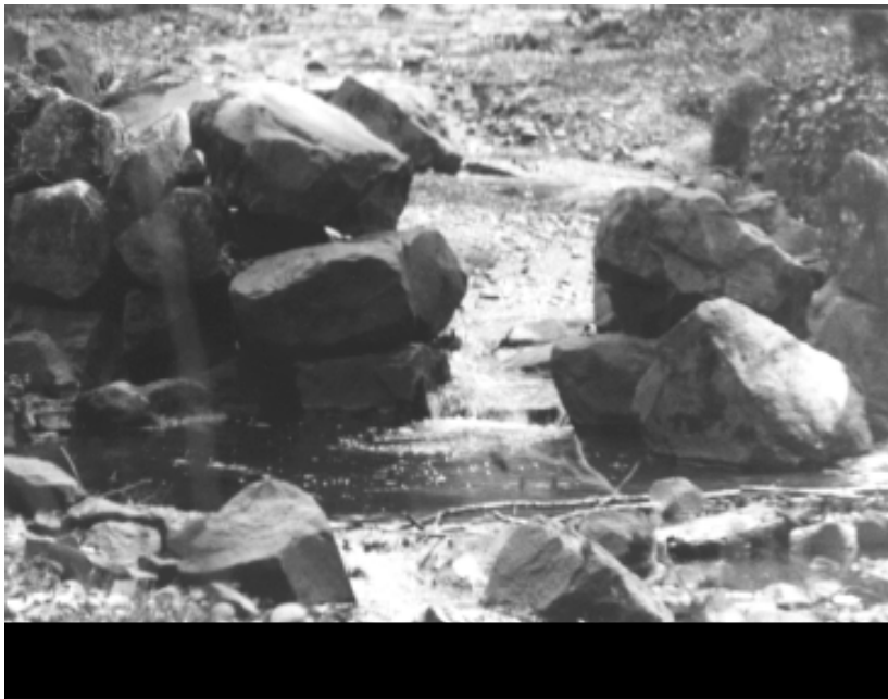
Table 3: Measures of Success at Pipers Creek