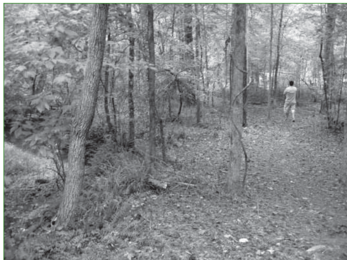
Residential nature trail