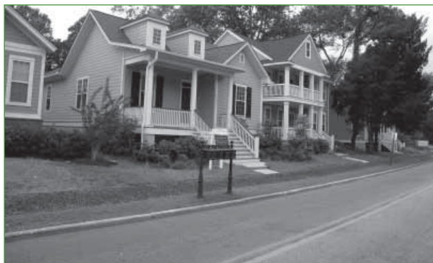
Development with relaxed setbacks

The roundtable supports this principle and makes the following recommendations: