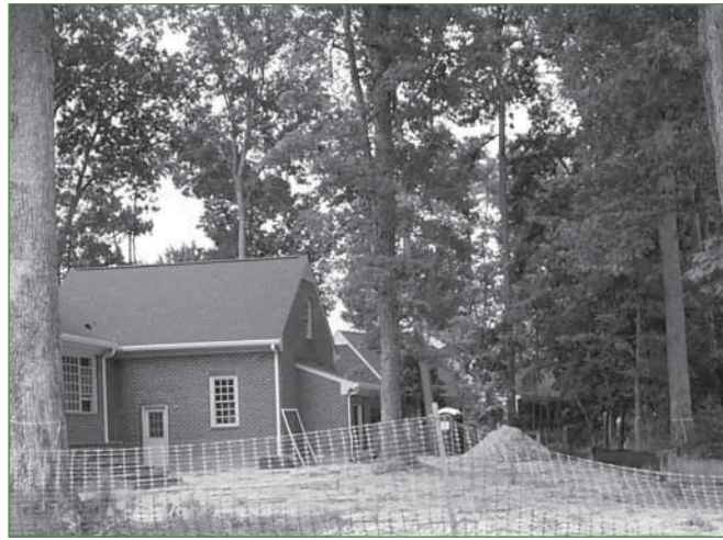
Trees protected during development

New definition Mature Tree. Any tree which has attained the maximum capability of growth, flowering and reproducing.