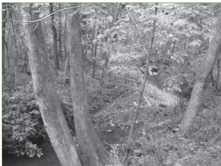
Forested stream buffer