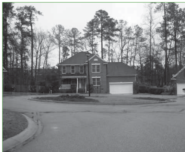
A cul-de-sac with a landscaped island