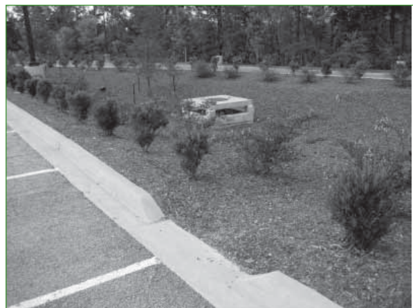
Parking lot runoff treated by bioretention

Parking lots generate high volumes of stormwater runoff and high levels of runoff contamination from pollutants deposited on the lot surface. Landscaped areas, which are usually required for new parking lots, can provide opportunities for capturing and treating this runoff from parking lots and other impervious areas. Many of the newer and “greener” stormwater management practices, such as bioretention facilities, permeable pavements, and swales, have not been frequently used in Richland County. The recommendations are intended to provide flexibility for the use of these stormwater management practices.