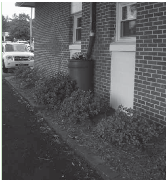
Rooftop runoff captured by a rain barrel

Directing rooftop runoff to porous areas such as lawns, forest, permeable pavement areas, rain gardens, dry wells, and rainwater harvesting systems contributes less runoff to the storm drain system. This is feasible on residential lots in Richland County. Homes that have gutters should be encouraged to direct their downspouts to areas that allow water to soak into the ground or to cisterns that allow homeowners to use their roof water for watering plants and other household uses.