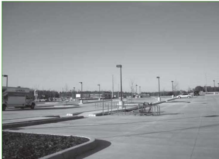
Parking lot with excess parking spaces.