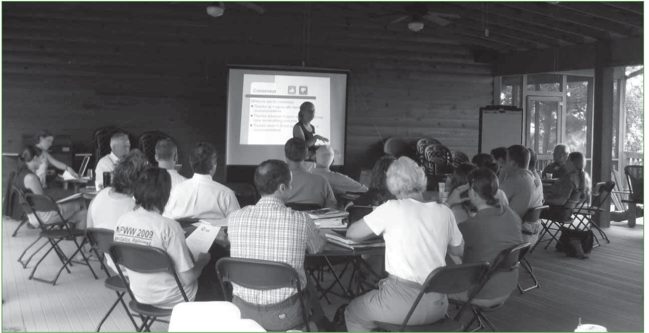
Roundtable participants discuss recommendations at Cooks Mountain