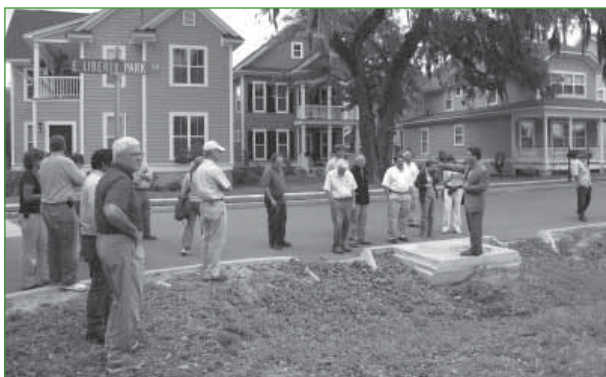
Roundtable Participants at Oak Terrace Preserve

Roundtable participants traveled to North Charleston, SC to visit the Oak Terrace Preserve Development. The development provided examples of tree preservation, reduced street pavement, and innovative stormwater management through vegetated swales, pervious pavement and bioretention.