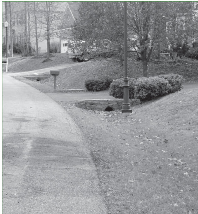
Vegetated open channel along residential street