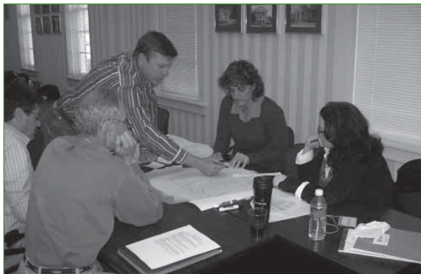
Roundtable Participants at Kickoff Meeting

Approximately 34 participants were involved in the meeting. Almost every major stakeholder group was represented including the development community, local government, and environmental groups. The kickoff meeting familiarized participants to the Better Site Design principles, the Roundtable process, and presented the results of the codes analysis.