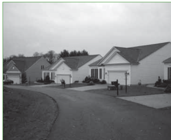
Narrow Residential Road